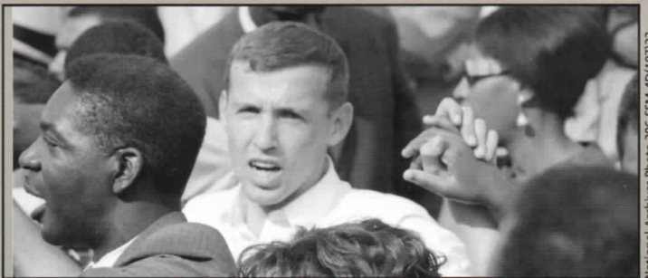
Dr. King speaks to marchers, 8/28/1963.