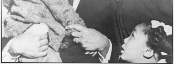
Dr. King with wife and children.

Leadership Conference (SCLC) dedicated to racial equality and economic justice, and co-founded by Dr. King, elected him as their president. He asked of those in the movement: "Are you able to accept blows without retaliating?" "Are you able to endure the ordeals of jail?" He proved unafraid of reinforcing his words in leading by example. He organized sit-ins, kneel-ins, mass meetings, and