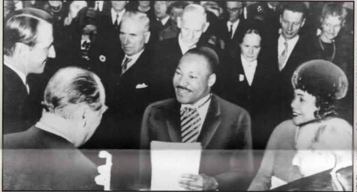
Dr. King accepting the Nobel Peace Prize, 12/10/1964.

The civil rights movement, galvanized by Dr. King's leadership, resulted in the passage of a series of Civil Rights Acts (1957, 1960, and 1964) and the Voting Rights Act (1965). Yet the movement was not bound by the limits of national borders. The Norwegian Nobel Committee awarded Dr. King the 1964 Peace Prize for his dedication to nonviolent tactics, an honor which resonated as loud as his powerful writing and oratory to advocates of peace worldwide. His method followed the example of Mohandas K. Gandhi and the Indian independence movement to develop a broad strategy for unarmed resistance. Dr. King was acutely aware of the parallels between the condition of African-Americans and others around the world. Dr. King was personal witness to this relationship, as he visited other nations where such change occurred. He remarked: "An old order of colonialism, of segregation, of discrimination is passing away now." 4