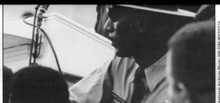
Dr. King delivering his "I Have a Dream" speech, 8/28/1963.

Memorial's presence clearly reinforces. Prominently in the center of his memorial, the image of Dr. King stands thoughtful and resolute. The work of master sculptor Lei Yixin, his frame emerges from the Stone of Hope, which stands an impressive 28 feet, 6 inches. It serves as a testament to Dr. King's leadership in the civil rights movement as a "drum major" for justice, peace, and righteousness. The enormity and strength of the granite reflects the steadfastness with which Dr. King and other members of the movement confronted the