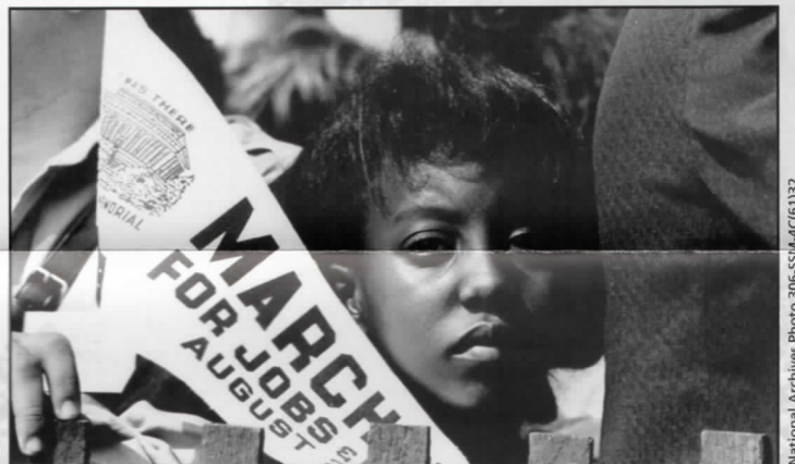
Young child in March on Washington for Jobs and Freedom at Washington, D.C., 8/28/1963.

T he flowering Japanese cherry trees and their beautiful blossoms, which appear for just a few days every spring, are reminders of the beauty and brevity of life itself. Their return reinforces the tragedy of the untimely passing of Dr. King on April 4, 1968, and the need for persistence in subsequent generations in the struggle for human rights. As the memorial and its environs echo these sentiments in stone, earth, and water, so do the words of Dr. King, delivered in a sadly prophetic speech the day before his death.