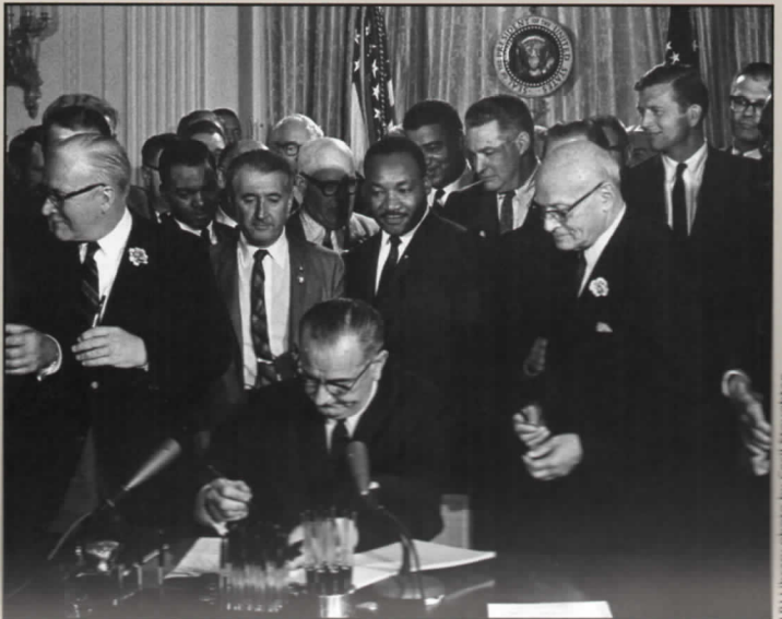
President Lyndon Baines Johnson signs the Civil Rights Act, 7/2/1964.

National Archives Photo 306-SSM-4C(15)13