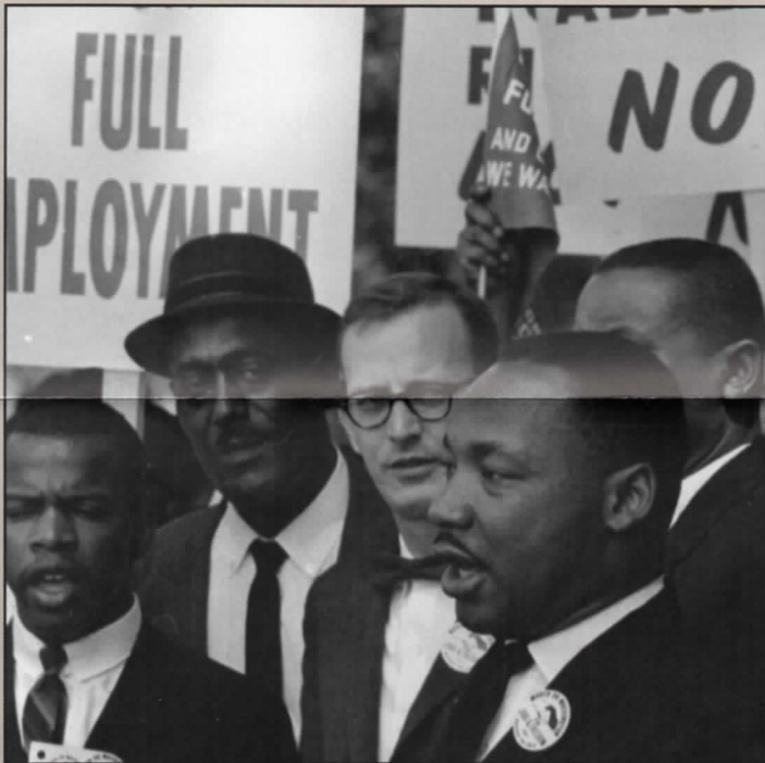
Dr. King speaks to marchers, 8/28/1963.

LC-USZ62-122979